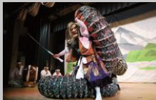
[Kagura performance] ① From 11:00 ② From 13:00

Inquiries: Yufu City Commerce and Industry Association Yufuin Branch ☎0977-84-2445