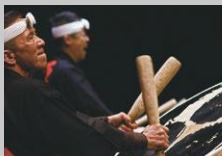
[Yufuin Genryu Daiko Drums] From 19:00

Inquiries: Yufu City Commerce and Industry Association Yufuin Branch ☎0977-84-2445