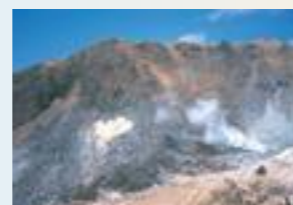
Tsukahara Hot Springs

Yunohira has been known for its hot springs for over 800 years. Sloping cobblestone roads, built during the Edo Period, create a peaceful atmosphere.