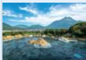
Yufuin Hot Springs

Yufu City is famous for its abundant hot springs. We recommend a long, healing soak in one of the area's many hot spring baths after your hike.