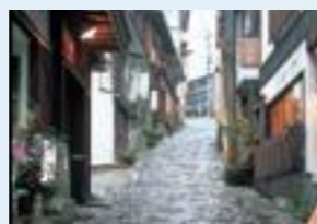
Yunohira Hot Springs

These hot springs are located in Yufuin Basin. You will feel bliss as you soak in the hot springs while enjoying Yufuin's natural scenery, such as the famous morning mists, or Mount Yufu.