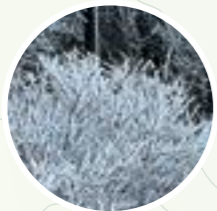
Hoarfrost A gift of winter. Seeing the crystals sparkle against the blue sky as they reflect the sun's light is an experience that shouldn't be missed.